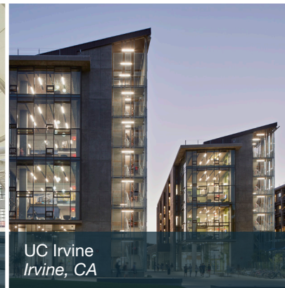
UC Irvine Irvine, CA