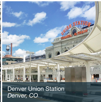
Denver Union Station Denver, CO