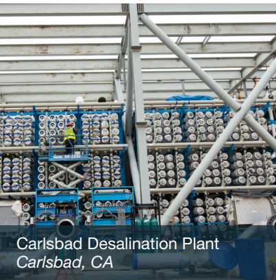
Carlsbad Desalination Plant Carlsbad, CA

See more design-build projects at projects.dbia.org .